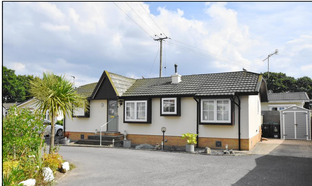
Spacious Park Home with Large Kitchen/Diner

60 Hillbury Park, Hillbury Road, Alderholt, Fordingbridge. SP6 3BW